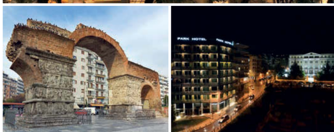
Arch of Galerius